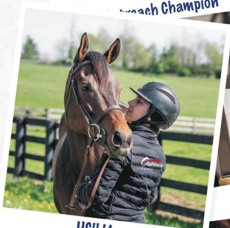
USHJA Outreach Champion