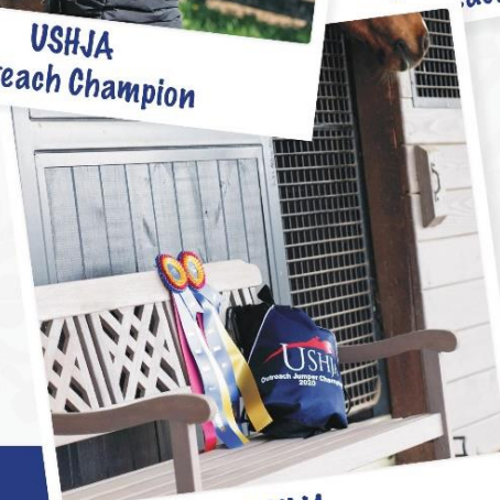
USHJA Outreach Champion